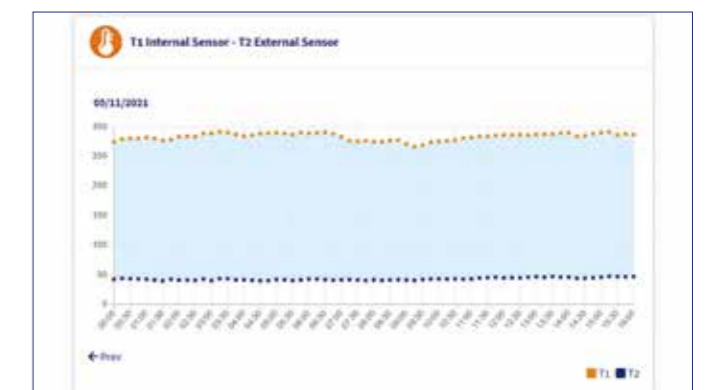
Thermal measurement: Temperature trend inside and outside the insulation